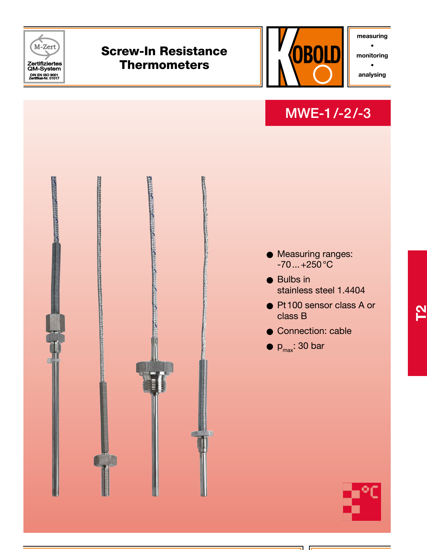
KOBOLD companies worldwide:

AUSTRALIA, AUSTRIA, BELGIUM, BULGARIA, CANADA, CHINA, CZECHIA, FRANCE, GERMANY, GREAT BRITAIN, HUNGARY, INDIA, INDONESIA, ITALY, MALAYSIA, MEXICO, NETHERLANDS, PERU, POLAND, REPUBLIC OF KOREA, SPAIN, SWITZERLAND, THAILAND, TUNISIA, TURKEY, USA, VIETNAM